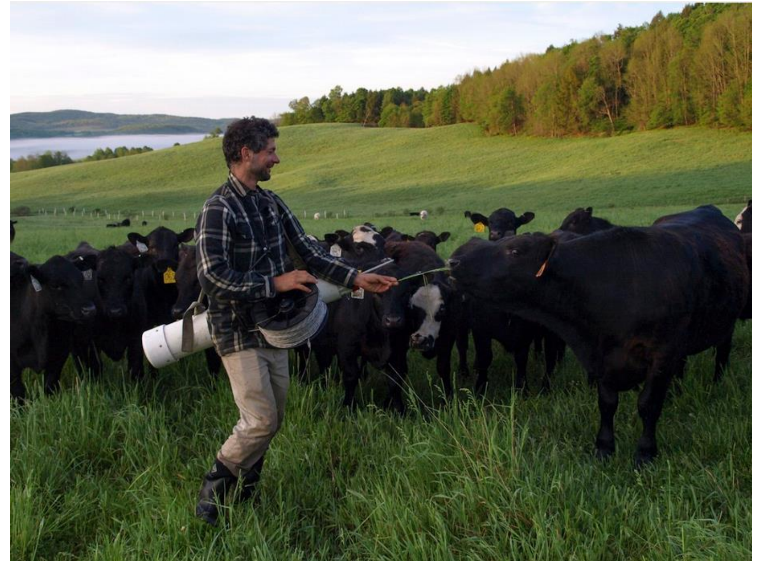
Cairncrest Farm in central New York sells grass-fed, grass-finished beef and lamb, pastured chicken and pork. They were awarded the USDA Value-Added Producer Grant for marketing, storage, animal processing, and shipping.